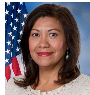
Rep. Norma J. Torres Co-chair, Central America Caucus, U.S. Congress