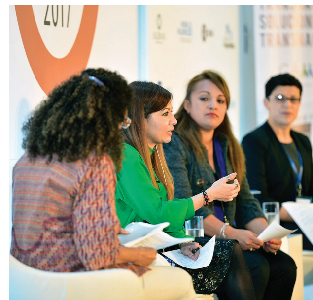
Members of the Central America and Mexico Migration Alliance (CAMMINA) discuss migration.

maximize positive effects of migration. The grave situation that migrants face in the region results from a highly complex dynamic that requires sustainable changes that not only benefit migrant, refugee and asylum-seeking populations, but also promote development through political and institutional reforms.