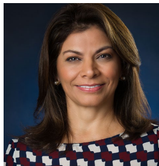
Laura Chinchilla Miranda Former President of Costa Rica