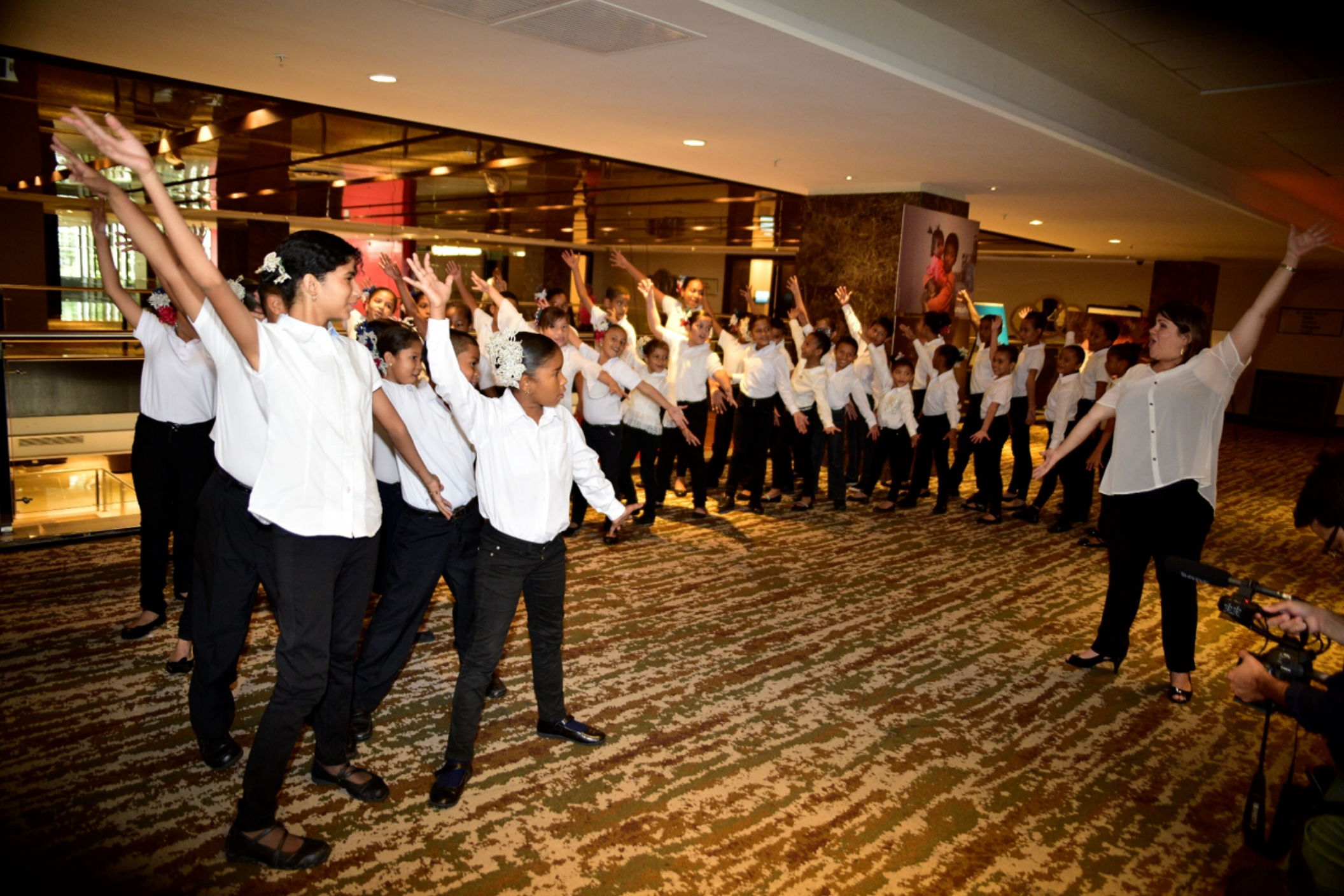
Musical performance by by La Red Nacional de Orquestas y Coro Infantiles y Juveniles de Panamá.